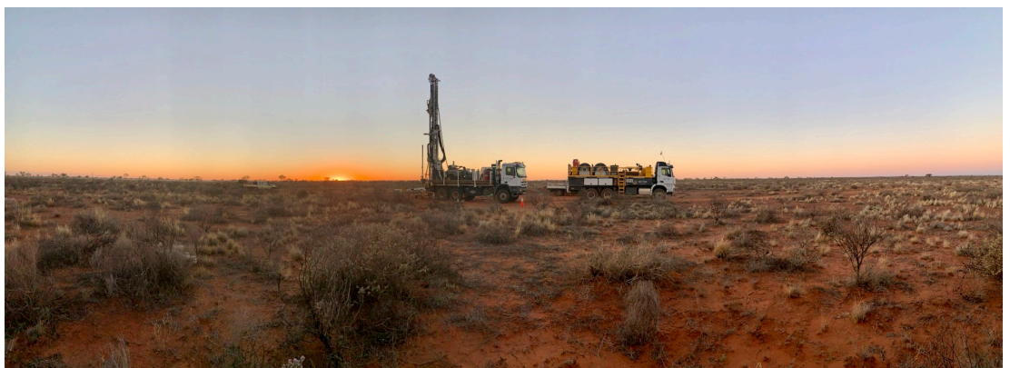
Aircore Drilling Commences at Lamil Main Dome